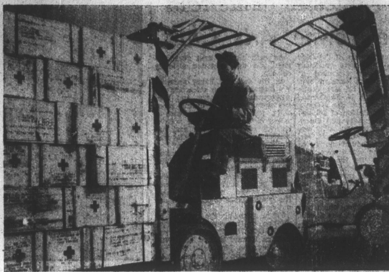
NEEDED LIFT for prisoners of war behind the Communist lines comes from the Red Cross office in Yokohama, Japan, where a lift truck loads food packages for shipment to Korea.