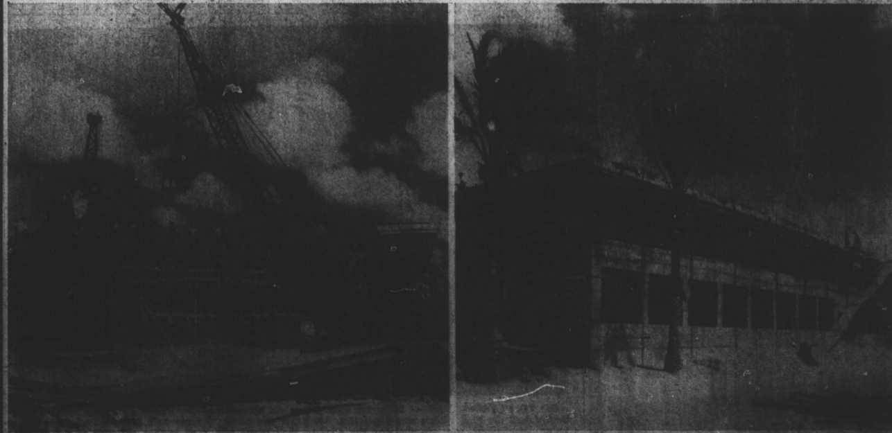
Army engineers supervise the pouring of concrete for an igloo-type building. Native limestone forms part of these airmen's barracks under construction.