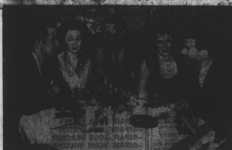
MILLION DOLLARS worth of talent from stage, screen, radio and television gathers at a New York night club for some relaxation. Stars are (from left) Tybone Power; Lilli Palmer; her husband, Rex Harrison; Mrs. Power (Linda Christian); and Jean Pierre Aumont.