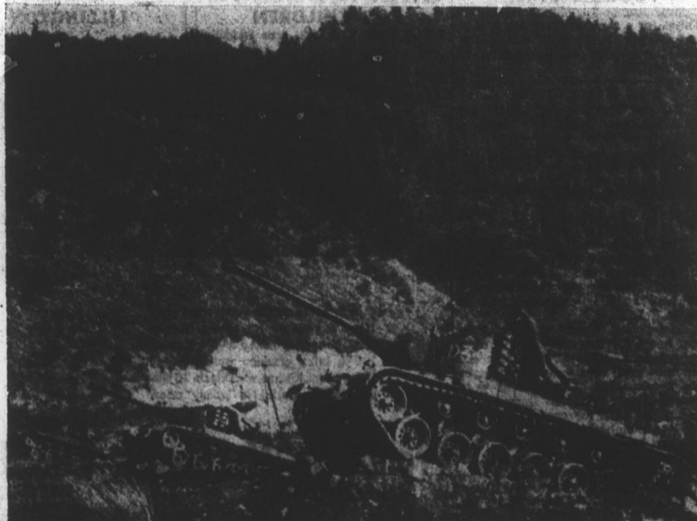
THREE MAILED YANKS creep on the firing line, awaiting signal to blast Communists in Korea.