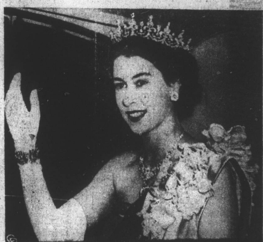
QUEEN ELIZABETH - This picture of England's new Queen was made as she waved to a crowd which watched her departure from Clarence House for a Buckingham Palace reception honoring Norway's King Haakon last year. Wearing a jeweled tiara, she was substituting for her father during his illness at the time.

As a few years later, while still in mourning, she watched by moonlight the parade of African big game which included a rhinoceros.