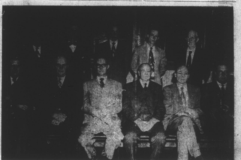
GODWIN LIONS CLUB OFFICERS — Shown are the officers and directors of the newly formed Godwin Lions Club, who were installed at a Charter Night program Friday night at the Godwin School auditorium.

MILWAUKEE, Wis. — A "quiet" 16-year-old boy said today he killed his mother, brother and sister in a fit of rage brought on when he was denied the use of the family car, Milwaukee police said.