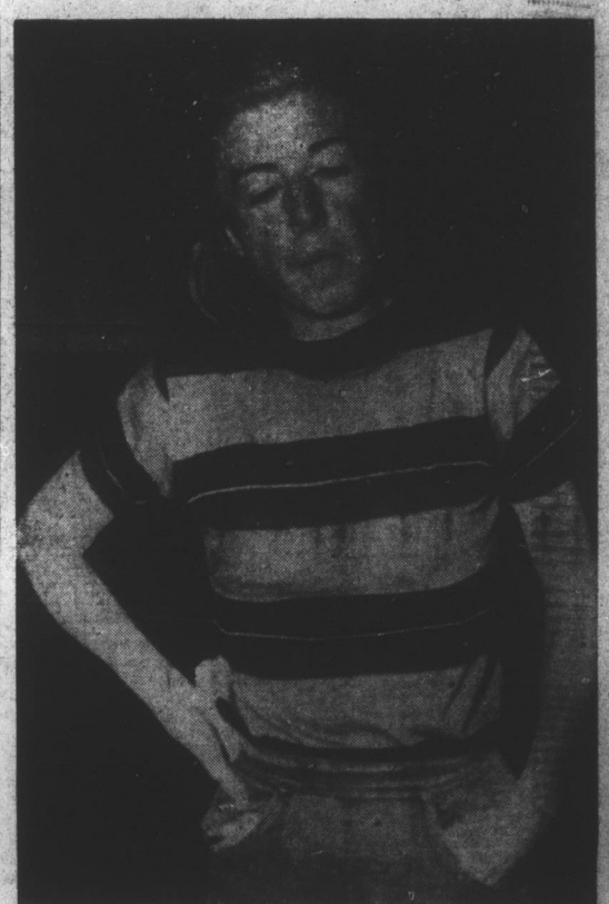
MYSTERY WOMAN — Pictured here in the Dunn jail is a woman, about 40 years old, who refuses to give police her name or tell them anything at all about herself. She was arrested here while roaming the streets of the town early Tuesday morning. Repeated questioning by police has failed to break her down. She'll discuss anything with them except information about herself.