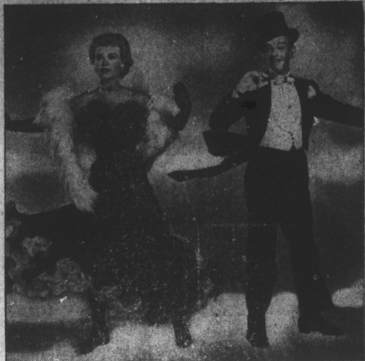
Vera-Ellen and Fred Astaire literally dance in the air in one of the arresting production numbers of their new M-G-M Technicolor musical, "The Belle of New York," opening at the Stewart Theatre. Marjorie Main and Keenan Wynn are other principals in a song-and-laugh-filled story of a Bowers mission worker who falls in love with a dancing playboy. The movie opens here Sunday.