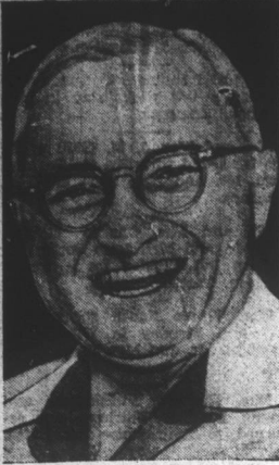
SUMMONED to the Winter White House at Key West, Fla., for a secret session described as "important," Gen. Hoyt Vandenberg (left) chats with President Truman on the lawn outside as palm trees form a backdrop. Above, looking tanned and well-rested, the Nation's Chief Executive beams at news photographers.