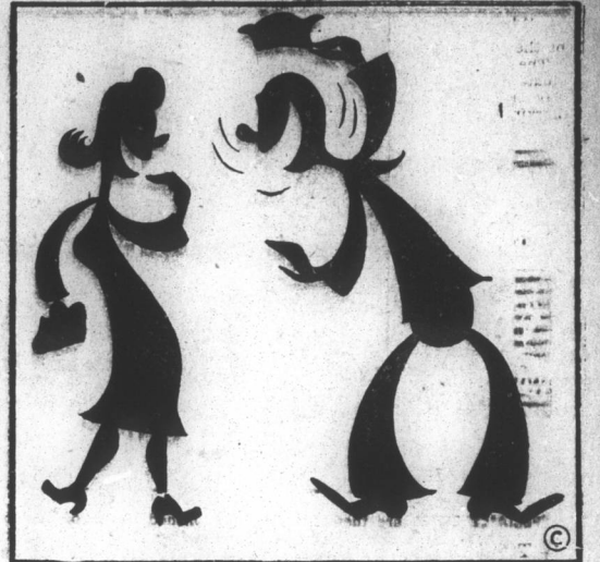
Honey — you're the best thing I've seen since they showed me the friendly atmosphere at MOTOR CREDIT COMPANY.