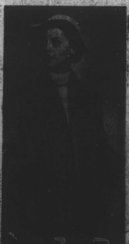
CURLEY little coat in finger-tip length with tuxedo revers. In flannel by ORIGINAL MODES.