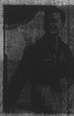
DUKE OF HOLLYWOOD'S new sport-suit of a trend-setting striped pattern. Called the "El Escorial," it's colored, casual, and tried at the-clubb-washable cotton.