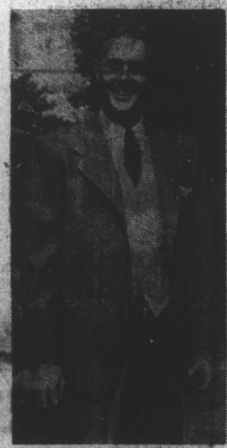
KUPFENHEIMER'S grey flannel, 3-button single-breasted suit combines with a handsome all-wool Tattersall vest for smart distinction.