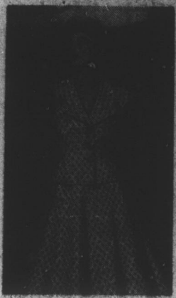
Printed silk Honan by BENHAR. The wide-collared jacket, tops a camels-top dress with taffeta-lined skirt.

You'll find them in soft, fleecy wools . . . basket weaves . . . cashmere. They may be close as a hug-me-tight or loose and boxy . . . but they must be brief . . . briefer . . . briefest!