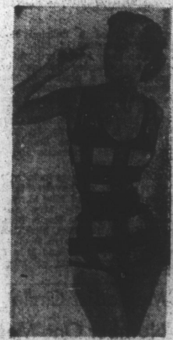
RUDE'S Black and white jersey suit.