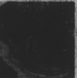
INTERNATIONAL SHOE in glove leather with two-cycle tie. SPORTS — PRE-SEASON