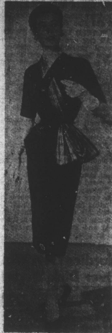
Navy meroelen with plaid silk taffeta draped through neckline and belt. A DEN REIG design by OMAR KIAM.

Practical equipment for the outdoor man... devotee of sun and sand... the ever-loving denim, with faded blue the favorite color. Now well-tailored, with pleated slacks... zippered waist-length jackets or the longer belted coats, worn with the cotton T-shirt in pavy blue, often collared with tabs of red and white. The shoe: navy denim, white-laced with heavy crepe soles.