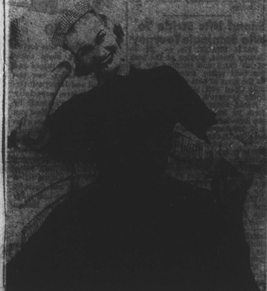
THE EXTRAVAGANTLY-TUCKED SKIRT MAKES THIS DRESS A STAND-OUT! Styled by A. GOODMAN of Burlington's new rayon sheer called "Treasure" and touched at the collar and cuffs with spitted polka dots. Black or navy sheer.