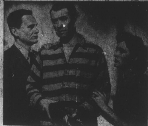
JIMMY STEWART AS WILLIAMS - In "Carbine Williams," powerful M-G-M drama to be released in June, James Stewart enacts David Marshall Williams of Godwin, noted gun genius, who began his remarkable firearm inventions while in prison in North Carolina and won freedom to achieve success and fame. Co-starring are Jean Hagen, right, as his loyal wife, and Wendell Corey, left, as the prison warden who became his best friend.