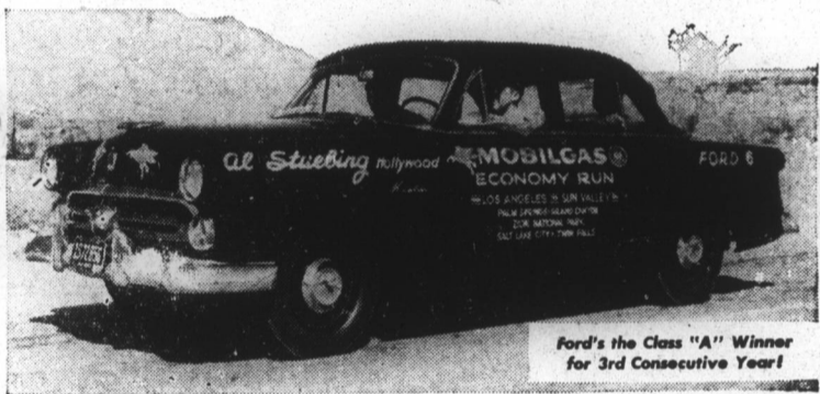
Ford's the Class "A" Winner for 3rd Consecutive Year

New Ford Mileage Maker SIX Thriftiest in its Field!