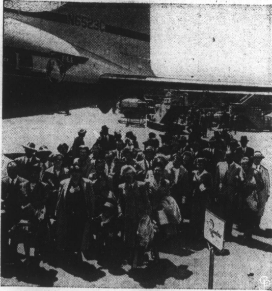
THE RUSH IS ON at Idlewild Airport, New York, as one of the first groups of tourists to take advantage of the newly inaugurated air-coach service between the U. S. and Europe got under way. Eleven trans-Atlantic airlines are taking part in the new low-cost service. The fare from New York to London is $270 one way, compared to the regular fare of $395.