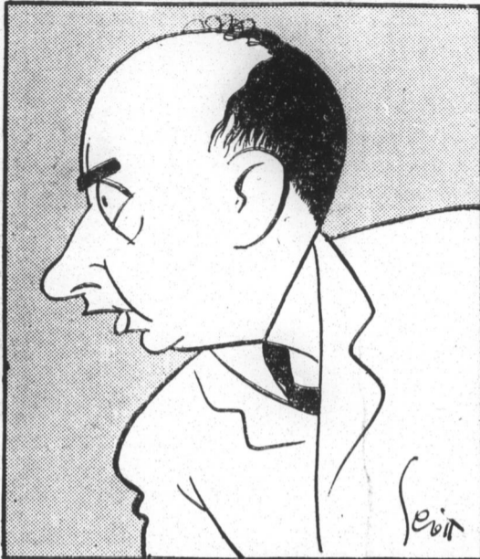
GOV. ADLAI STEVENSON