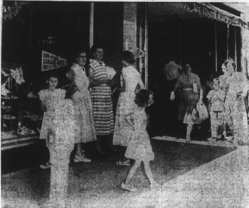
SHOPPERS HERE FOR BARGAIN DAYS — Dunn's city-wide Bargain Days event got underway this morning and a large crowd of thrifty-minded shoppers were in town for the event. Pictured here is the scene on East Broad as shoppers hurried from store to store for bargains. Bargain Days will continue through Saturday night.