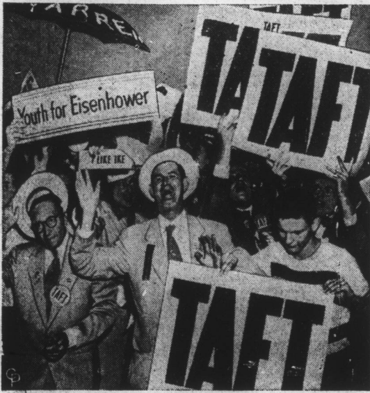
EISENHOWER AND TAFT DELEGATES jam the corridors of the Conrad Hilton Hotel in Chicago, while members of the Republican National Committee debate the seating of the delegates from Texas. After about three hours of debate, the group voted 60 to 41 to accept Sen. Robert A. Taft's proposal giving the Ohio Senator 22 delegates against 16 for Gen. Dwight D. Eisenhower. The general's forces declared they would appeal the ruling to the Credentials Committee.