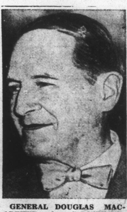
GENERAL DOUGLAS MACARTHUR, who will deliver the keynote address at the Republican National Convention tonight at 8:30 o'clock. The address will be carried over all radio and television networks and over practically all radio stations. Gen. MacArthur is regarded as the nation's greatest orator.

CHICAGO (AP)—Sen. Henry Cabot Lodge said today all efforts had failed at reaching a compromise of the bitter Republican fight over the rules governing seating of contested delegates. BULLETIN