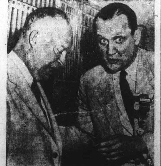
GETTING THEIR HEADS TOGETHER in Chicago are Gen. Dwight Eisenhower (left) and Sen. William Knowland, chairman of the California delegation, who has been mentioned as a vice presidential possibility if Ike wins the nomination. Eisenhower told the Californians that he will "do my best" to assure a Republican victory in November whether or not he is chosen as the party's leader.