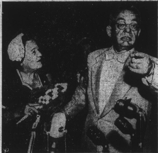
TAKING A CUE from the Republican convention battle over contested delegates from Texas, the Democrats are fighting their battle over contested Lone Star delegates.