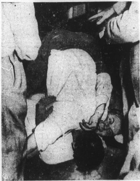
OPENING THE DEMOCRATIC National Convention with a bang, two unidentified brawlers mix it up in Chicago's Palmer House as a California caucus is crashed by fellow-Californians who had failed to have the chosen delegate unseated.