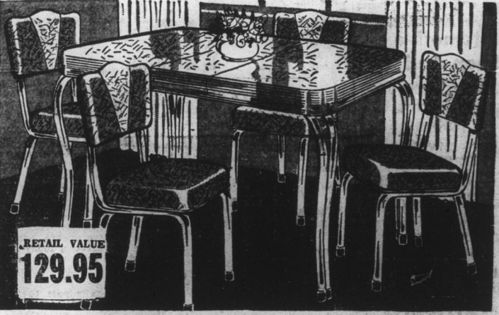
This sleek, modern extension-top chrome dinette has a Formica table top . . . matching chairs have Duran spring seat and back. Set includes table and four chairs . . . as shown in the photograph.

THIS BEAUTIFUL NEW FORMICA, EXTENSION-TOP CHROME DINETTE WITH YOUR PURCHASE OF THIS