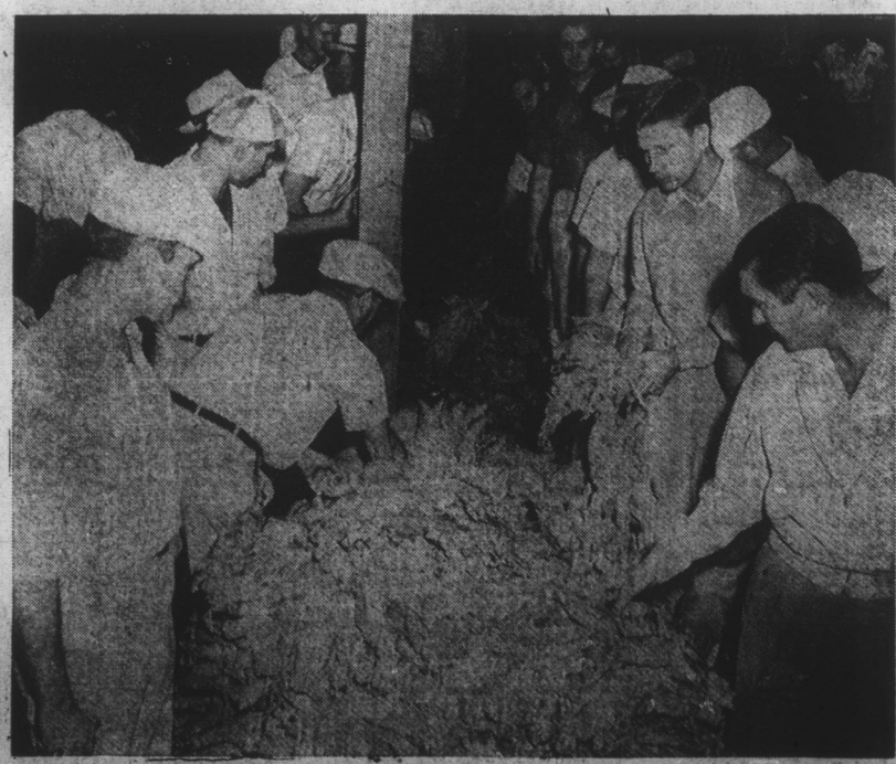
TOBACCO BUYERS GALORE — This picture was made this morning as tobacco buyers went up and down the rows paying top prices for the golden leaf on the Dunn market. Dunn's tobacco market has 11 company buyers, which is more than any other set in North Carolina. All major tobacco companies and six independent companies are represented.

EGGS AND POULTRY RALEIGH (AP) — Central North Carolina live poultry: Fryers or broilers steady to weak, supplies generally adequate, demand fair to good; heavy hens steady to firm, supplies adequate, demand good. Prices at farm up to 10 a.m. today: Broilers or fryers 21-23 lbs. 32; heavy hens 21-24, mostly 21-22. Eggs steady to slightly weaker, supplies short, demand good. Prices paid producers and handlers FOB local grading stations: A large 60-61, A medium 51-53, B large 51-53. (Continued On Page two)