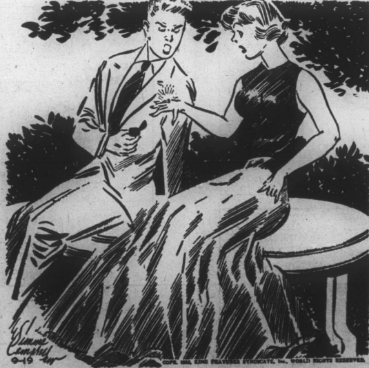
"Well, if it ISN"T a diamond, I've been gypped out of fourteen dollars and seventy-five cents!"