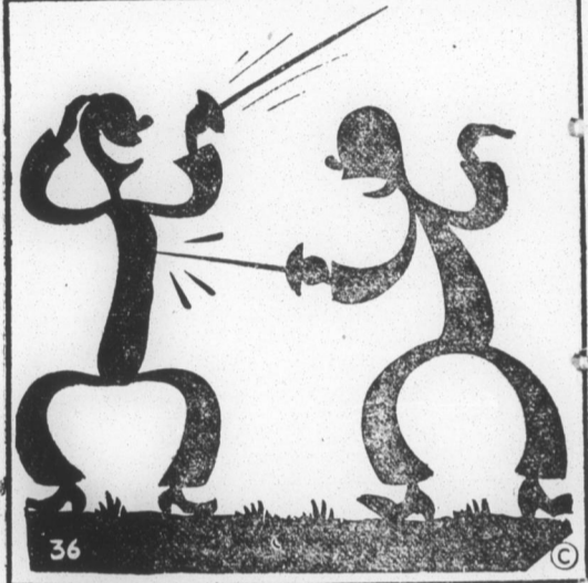
Don't fret Harold... I'm feeling no pain since I borrowed from Motor Credit Company!