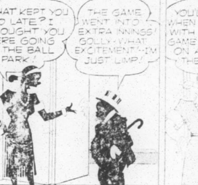
LIL' ABNER—By Al Capp