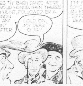
PRINCING UP CATER