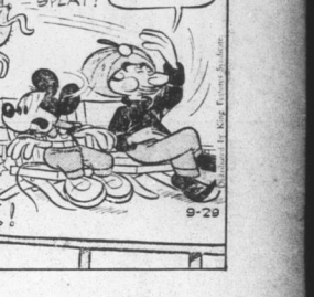
NANCY—By Ernie Bushmiller