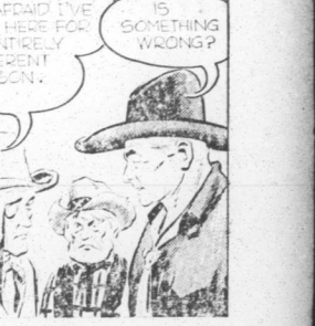
PRINCING UP CATER