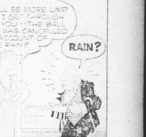
LIL' ABNER—By Al Capp