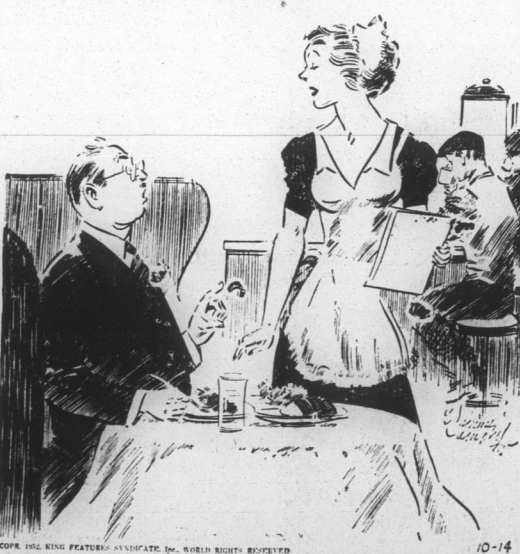
"So the meat tastes kind of funny! — Well, why don't you laugh?"