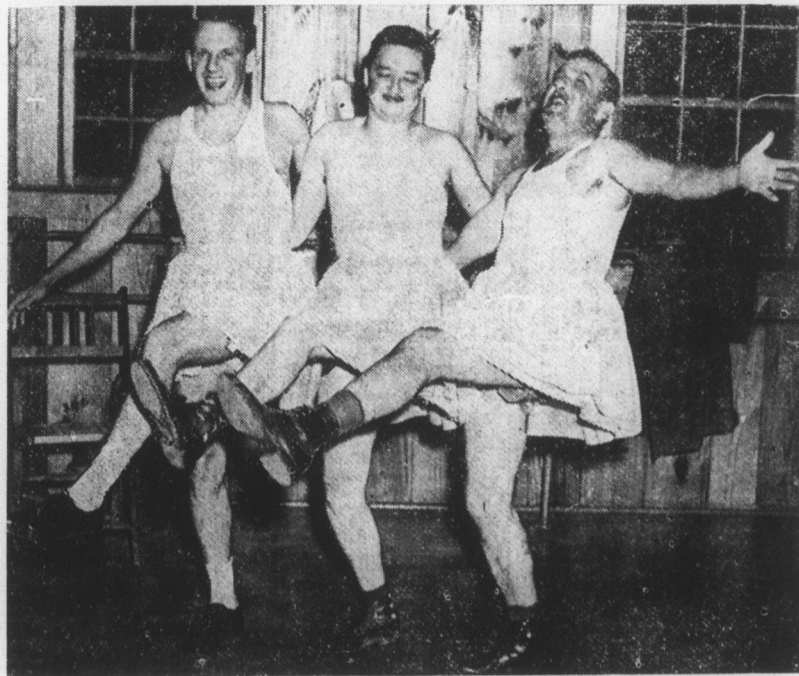
LOVELY LADIES OF THE CHORUS - Pictured here are three of the "lovely ladies" of the chorus who'll perform—sweet and dainty—as one feature of the Dunn Lions Club's Variety Show to be held Thursday and Friday nights in the Dunn High School auditorium.