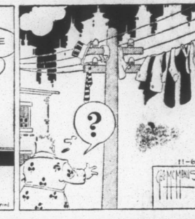
LIL' ABNER-By Al Capp