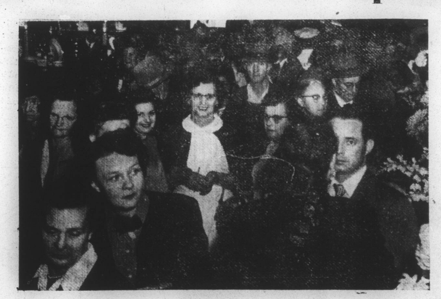
Pictured here is a small part of the crowd which was on hand yesterday afternoon when we opened the doors.

I want to take this opportunity to thank all of those who attended our Grand Opening yesterday and today and to extend a cordial invitation to others to visit us at the first opportunity . . . . It was one of the proudest moments of my life when the doors swung open and the crowds rushed in to see the new Monroe Jewelers .... It thrilled us to hear your many fine compliments and your praises .... You were most generous in your kind remarks and we are grateful to you .... Remember, it is your store .... Use it often to fill your every need in jewelry .... And, always, you'll receive a big, friendly welcome and courteous and polite service here. Thank you.