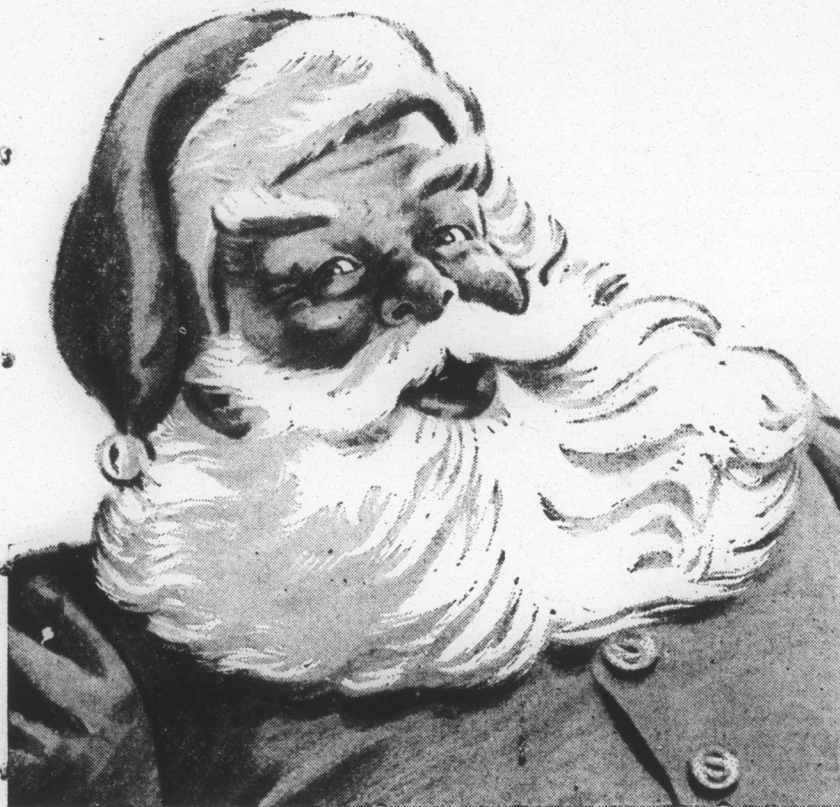
TO RIDE IN PARADE — Old Santa Claus, the hero of the season, will ride in the big Christmas Parade to be held here Friday night at 6:30 to formally usher in the holiday season.