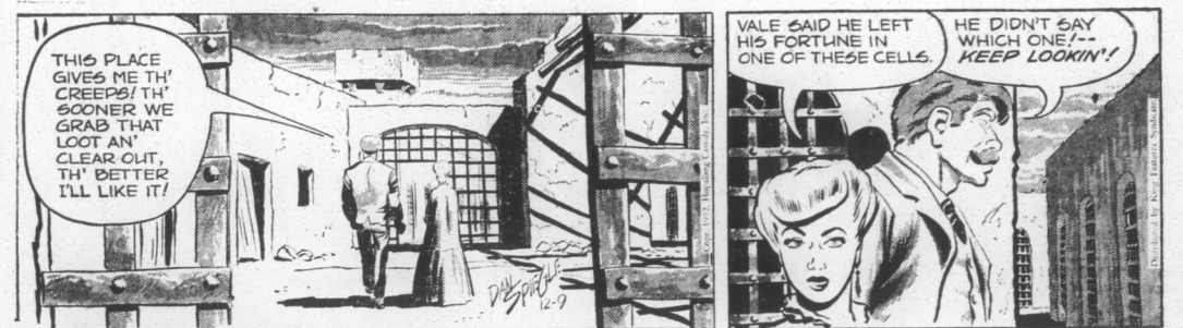
BRINGING UP FATHER