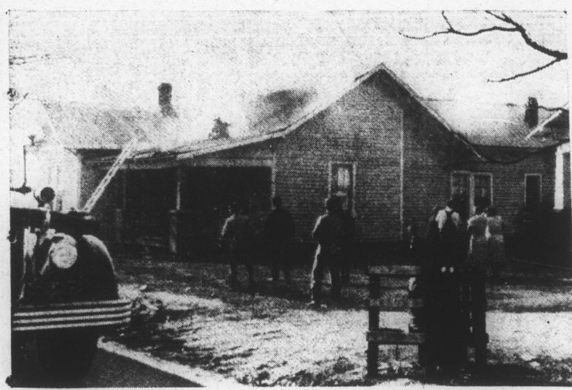
FIRE THREATENS HOUSE HERE — Prompt work by the members of the Dunn Fire Department saved the house shown here from complete destruction yesterday. When the men arrived they found the rear roof and kitchen sheathed in flames. They put out the blaze, caused by an oil stove explosion, and prevented their spreading from the rear roof and kitchen to the rest of the house. The house is occupied by Rex Watson and owned by George F. Pope.