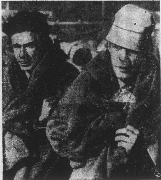
BROUGHT SAFELY ASHORE on a breeches buoy, these sailors from the severed Navy supply ship Grommet Reeder huddle in warm blankets at Leghorn, Italy. They were among the 39 crewmen rescued when the vessel broke on a reef during a heavy gale.