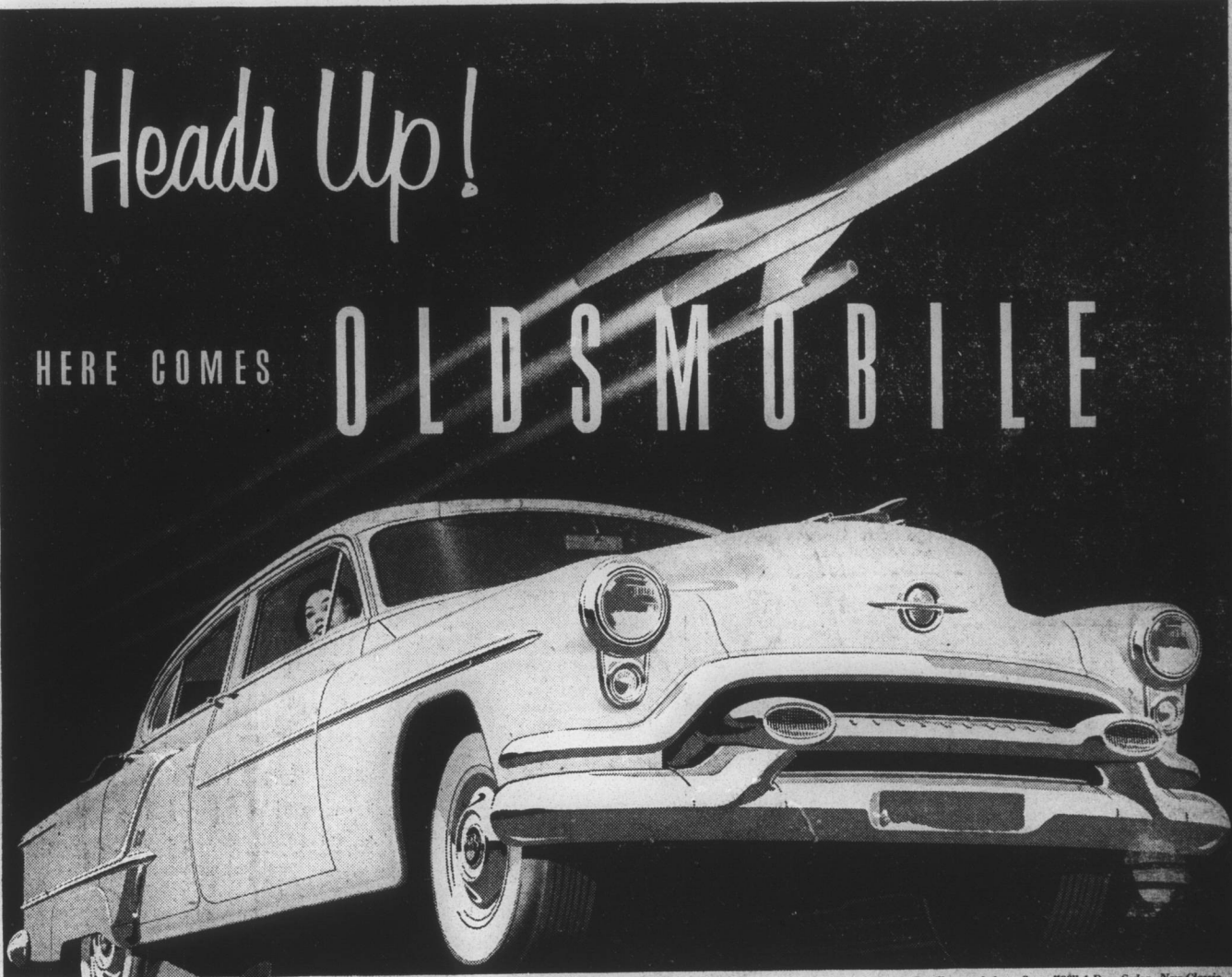
Car illustrated above: Super "88" 4-Door Sedan. New Classic Ninety-Eight also now on display. A General Motors Vehicle.