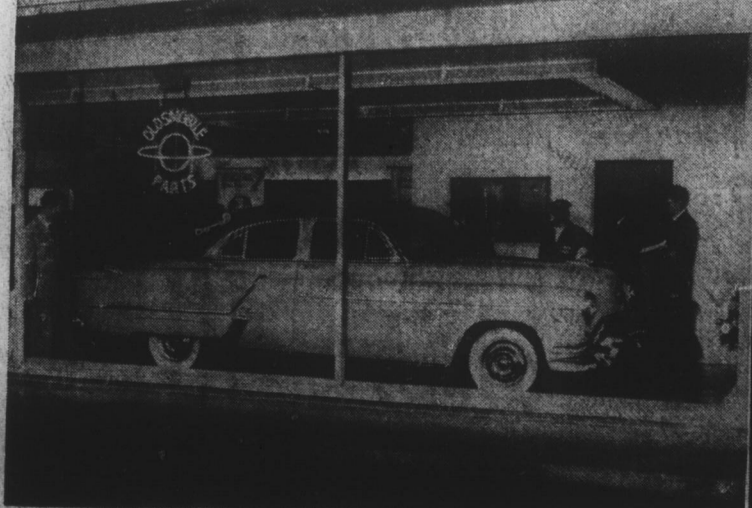
OLDSMOBILE AT LEE MOTORS

BARCELONA, Spain (AP)— Three robbers convicted of (Continued on page two)