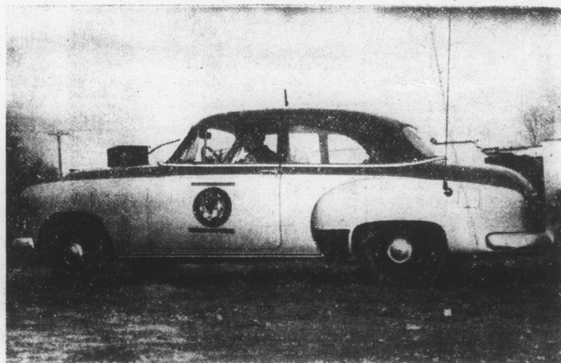
THIS IS THE WHAMMY — The inconspicuous little black box on the front of the patrol car shown here, is the radar scanning screen of the speed checking device which was placed in operation in this section Saturday by the State Highway Patrol.

SEOUL, Korea (AP) — The entire Korean cabinet flew here from Pusan today for a farewell meeting with retiring 8th Army Commander Gen. James A. Van Fleet.