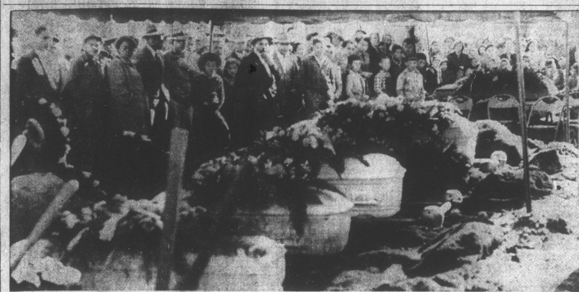
SIX VICTIMS OF FIRE TRAGEDY BURIED — Pictured here, resting side by side in the Warren Family Cemetery near Dunn are five coffins containing the bodies of six members of an Indian family who were burned to death after a kerosene explosion in their home Tuesday night.

WASHINGTON (AP) — Republican and Democratic congressional leaders today received a White House briefing on what they called a "grim picture" of the military situation abroad.