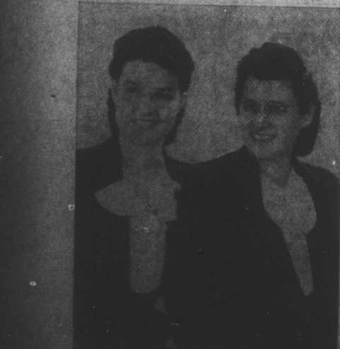
APPEAR HERE — Pictured here are two members of the Gospel Singers Evangelistic Party which will appear at the Gospel Singers in Dunn tonight, Saturday night and Sunday night at 8 o'clock. It will be an outstanding series of services and the public is cordially invited.