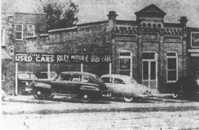
SITE OF THE NEW BANK — This is the place in Lillington where the Bank of Lillington plans to erect a $40,000 new bank building. To be so, the bank will demolish the old bank building, seen here and now vacant, where the same bank opened 54 years ago on August 31, 1903. New building will also extend across the vacant car lot giving a 32 foot glass front.