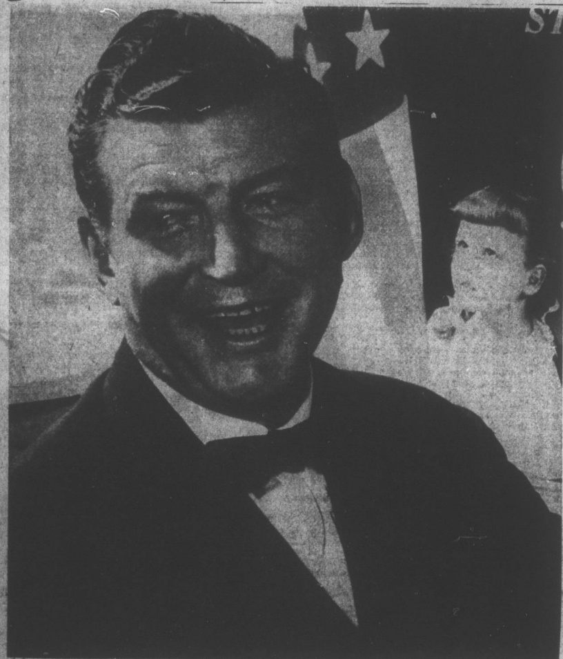
SENATOR ALTON A. LENNON