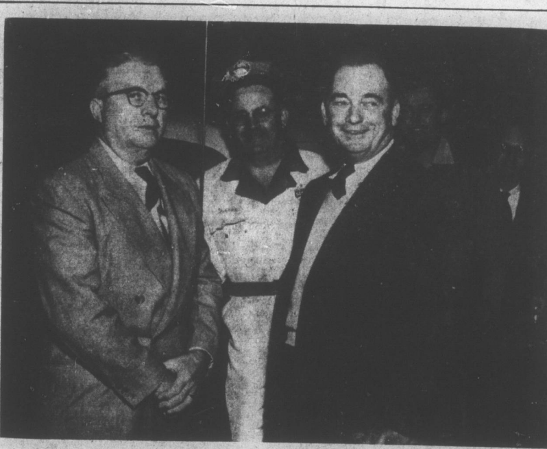
ACCLAIM DeSOTA — Everyone was around to inspect the 1954 DeSota when W. & S. Motor Company opened their office this morning. The streamline models were brought into the office yesterday afternoon and were on display today.