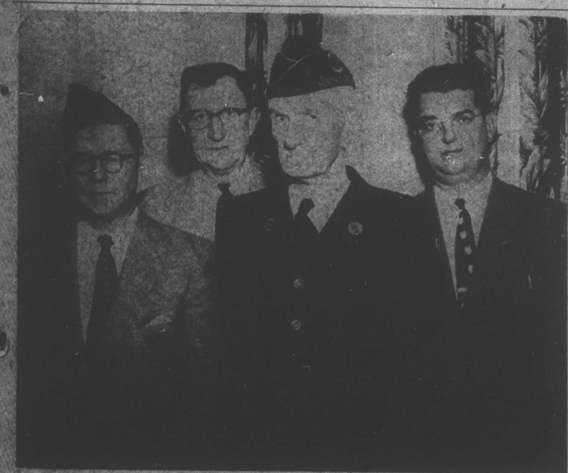
LEGION DINNER - Principals at the American Legion dinner last night in honor of Harnett County's two POWs are pictured above.