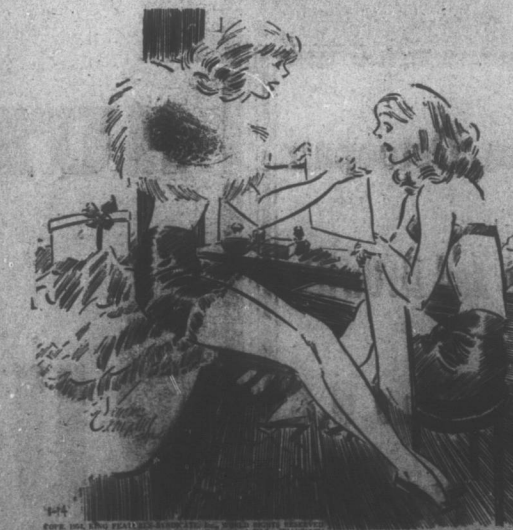
"It's better than a Hollywood contract—it's the certificate of my marriage to a Hollywood producer!"