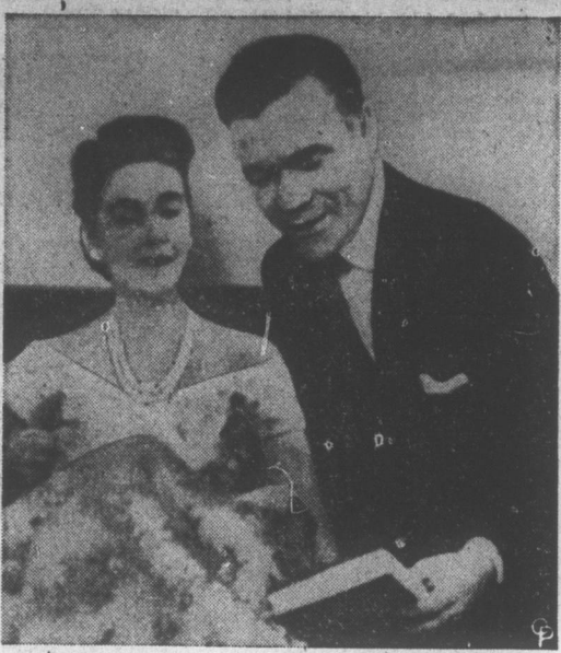
Porfirio Rubirosa and his bride, the wealthy Barbara Hutton, are shown during an evening at home in their New York hotel suite. They are looking over some books. The couple were forced to spend the first part of their honeymoon at home when illness of Barbara delayed a trip to the Dominican Republic.