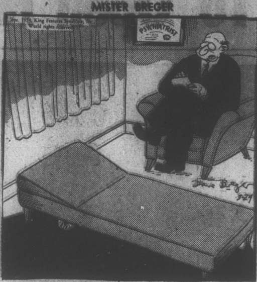
"It will take a bit of time but I'm sure we can cure your shyness..."

Not all problems can be solved swiftly, by the use of the writ. This one requires thorough study. At the moment, it is the Alger case, it is a later date of Alger's confession.