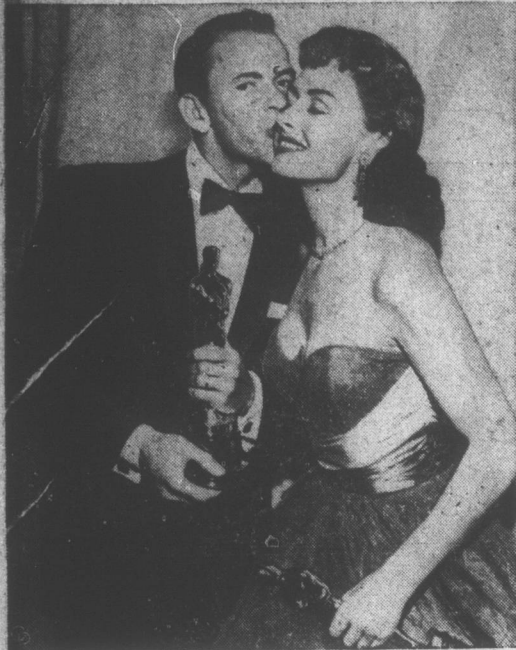
FRANK SINATRA KISSES DONNA REED in Hollywood as a fitting tribute from motion pictures' best supporting actor of 1953 to the best supporting actress. The Academy of Motion Picture Arts and Sciences selected the pair for their performances in Columbia's "From Here to Eternity," which was named the best picture of the year. "Eternity" won awards in eight categories to tie the all-time record.