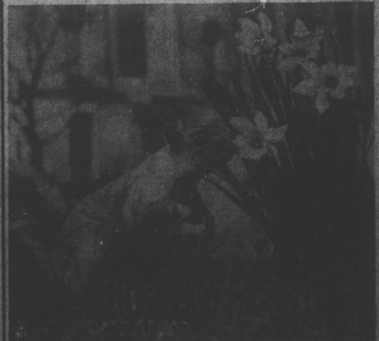
IT MAY SEEM a bit nutty, but this Washington, D.C., squirrel appears to be daffy over daffodils. And since they are blossoming on the Capitol lawn, he's getting his two cents worth.