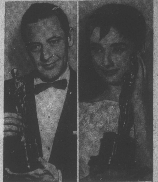
WILLIAM HOLDEN AND AUDREY HEPBURN clutch their Academy Awards at opposite ends of the United States after they were named best actor and best actress of 1953. Holden received his "Oscar" in Hollywood for his portrayal of the hard-bitten prisoner of war in "Stalag 17." Audrey was given her award in New York for her performance in "Roman Holiday," her first appearance in a motion picture.