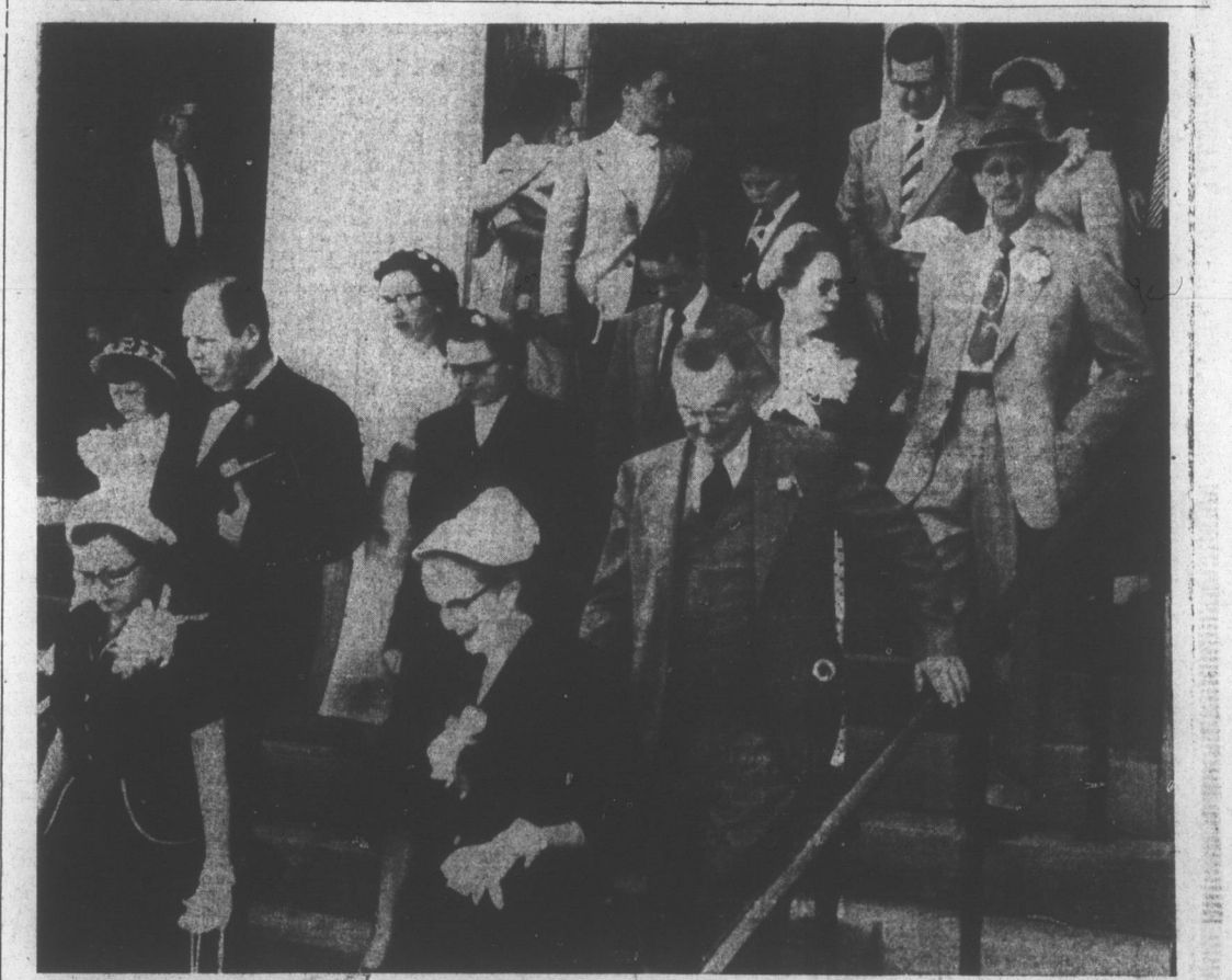
THIS WAS DUNN'S EASTER STORY — Church services, glad rags and orchids tell the story of how Easter was celebrated in Dunn yesterday. Typical of church-going crowds was this one leaving services at the town's big First Baptist Church. You'll be able to recognize many well-known citizens in this picture. For other pictures of Dunn's Easter Parade, see Tomorrow's Daily Record.