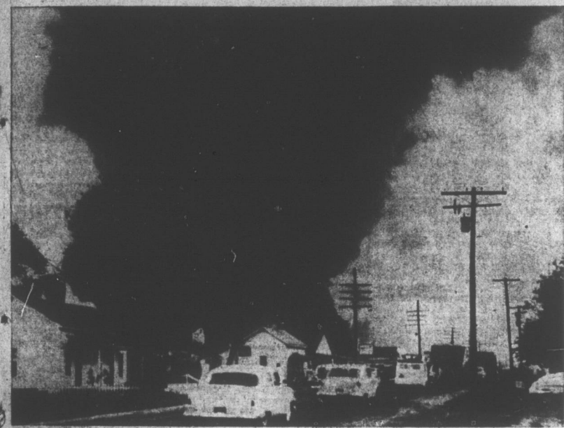
SCENE FROM A DISTANCE — One section of Dunn was blanketed by this huge billow of smoke which poured from the fire Friday afternoon.

Asked if he would appear also as (Continued On Page Five)