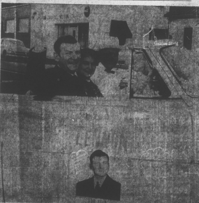
LENNON BEGINS HARNETT TOUR — United States Senator Alton A. Lennon is shown here this afternoon as his motorcade pulled out from the Dunn Cotton Yard for a tour of the Harnett area.