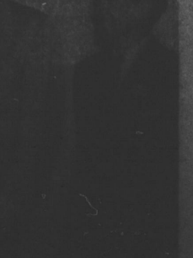
Young Republican... (Continued On Page Six)