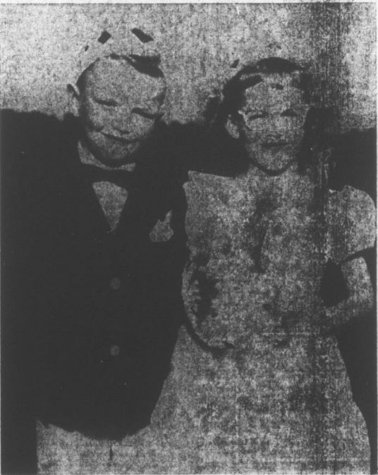
MAY DAY - The two sections of the first grade of Erwin School presented a gala May Day celebration Friday afternoon at the school. Pictured above are the King and Queen of the festivity.