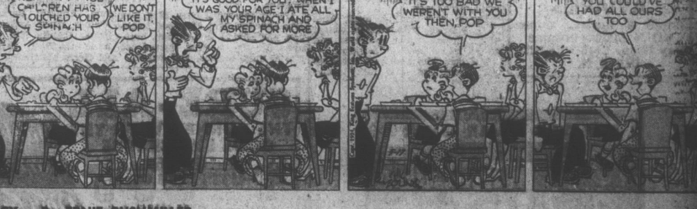
NANCY - By ERNIE BUSHMILLER