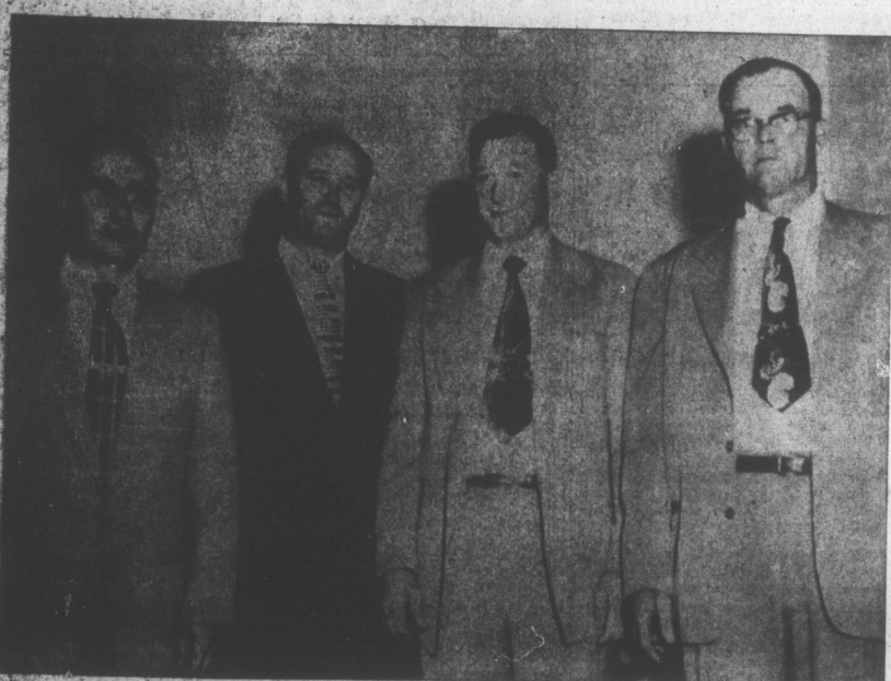
AT ERWIN CHURCH CONVENTION Pictured here are some of the principals at the Eastern Carolina Advent Christian Church Sunday School Convention held Sunday at Erwin and attended by delegates from all sections of Eastern Caro-