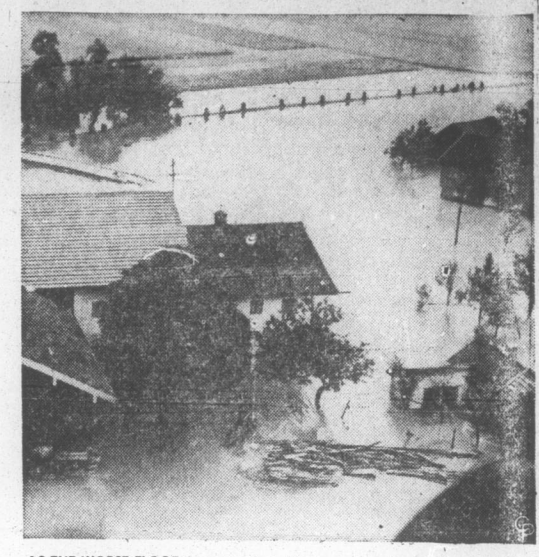
AS THE WORST FLOOD in more than 50 years swept over large sections of Central Europe, some 50,000 persons were reported evacuating their homes. Sixty hours of rain and melting Alpine snows caused the Danube and many of its tributaries to go on a rampage. Hardest hit was the Austro-German border, where 15 are reported dead. Showa here is an inundated farm area near Burghausen.