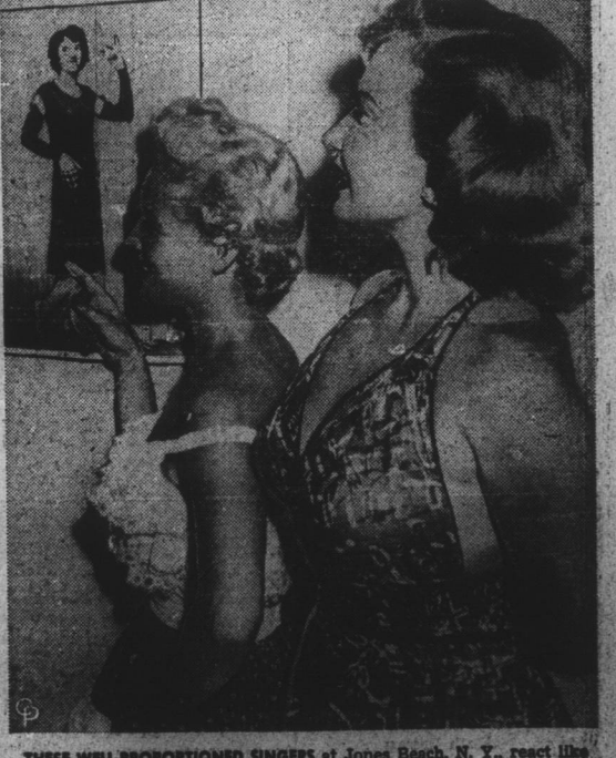
THESE WELL-PROPORTIONED GIRLS at Jones Beach, N. Y., react like most curvaceous girls to the news that the bossless fashions of the 1920's are due to return, according to Christian Dior, noted French dress designer. They are looking over a photo of a flapper-era dress. They say Dior's new look is "not for us."