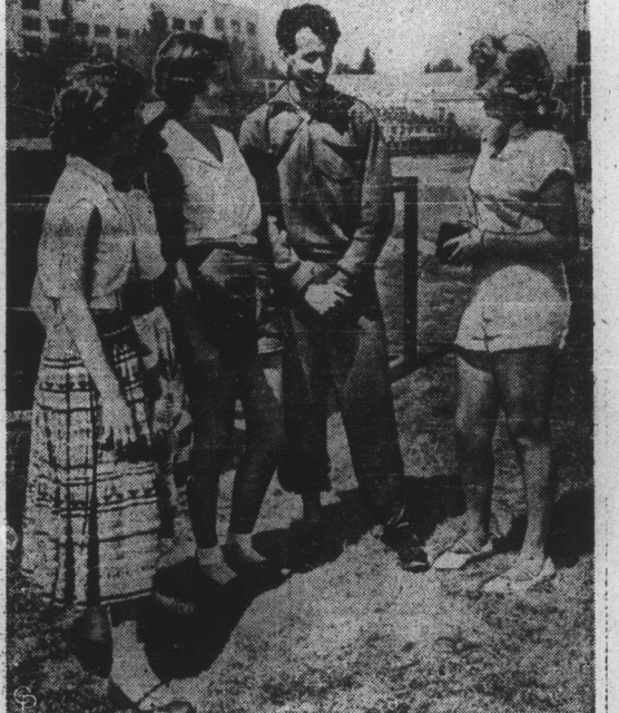
JOHN LANDY, who ran a mile in 3:58, chats with a group of teen-agers on his arrival in Vancouver for the British Empire Games. Landy, from Australia, will meet England's Roger Bannister, the man who first smashed the four-minute mile with a 3:59.4.