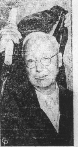
A DOCTORIAL HOOD is placed over the head of Dr. Syngman Rhee, president of the Republic of South Korea, after he received an honorary degree of Doctor of Laws from George Washington University, Washington, D. C. Rhee, who graduated from the college in 1907, told the gathering that education must fight for its freedom "while the freedom to fight remains."