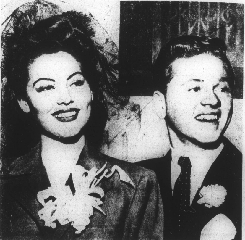
AVA AND MICKEY ON THEIR WEDDING DAY - Ava Gardner, who grew up near Smithfield, was still right much of a wide-eyed country girl when she married pint-sized Mickey Rooney, Re-

calling the marriage, she says it was "ridiculous" and friends say they were happy about two weeks of their year of married life.