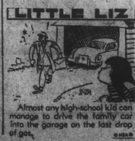
LITTLE LIZ Almost any high-school kid can manage to drive the family car into the garage on the last drop of gas.